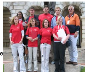
Youth advocates from Anna-Jonesboro

Youth Advocacy Day 2007 a Success! More than 200 people converged on the State Capitol on April 18, 2007 to speak with elected officials about their school health centers and to urge them to support SB 715. Close to 175 youth attended from 14 different schools making this the most successful Advocacy Day to date. Students, providers, teachers, partners, supporters, and ICSHC staff were able to communicate with 22 Senators and 12 Representatives. Without the voices of these youth advocates, SB715 could not have been successful.